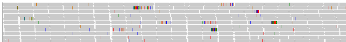
Figure 3: Simulated reads mapped in proper pair. Mismatches and soft-clips are shown as colored vertical lines in reads.